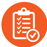
Background check in every staff