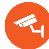
360 degree surveillance through CCTV cameras