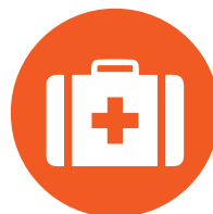
First Aid Kits