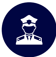
Security controlled entry & exit