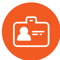
Student ID Cards