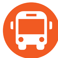
GPS equipped vehicles