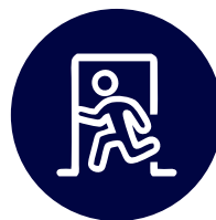
Periodic emergency drills